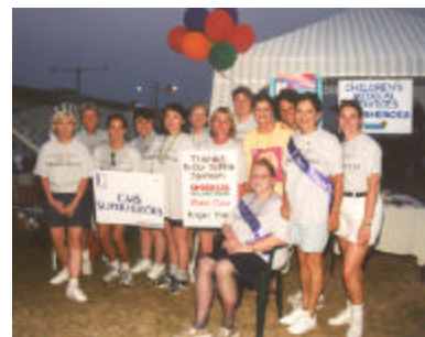
Chairman's Choice Award Team